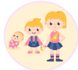
Recommendation based on age