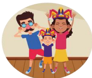
Play with your child and have fun!