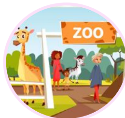
Exposure (e.g. life experiences, books)