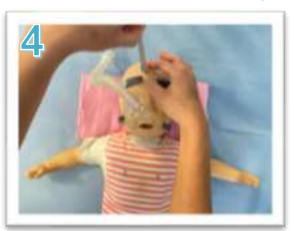
Thread the headgear through the mask