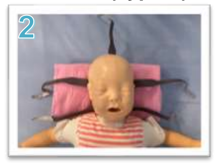
Position child's head on the headgear