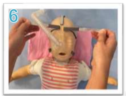
Adjust headgear's strap by ensuring one finger spacing between mask and face